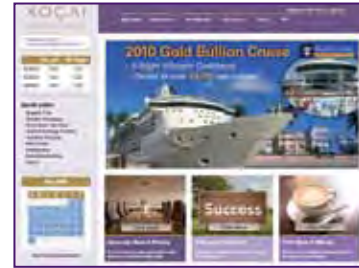
Sample Back Office

Log in to your MXI Corp Back Office ( mxi.myvoffice.com ) Go to “My Business” » “Genealogy” » “Graphic Tree” Click at the bottom of an outside leg (red circle), and complete each step